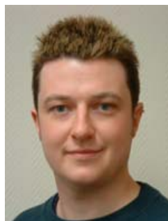
Andrew Brown Computer Support