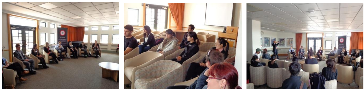
Beta Alpha Psi Massey 'Meet the Grad' Session on 9 October 2013.

Recruiters from PWC, Deloitte, EY and GT also attended the session on 2 October 2013.