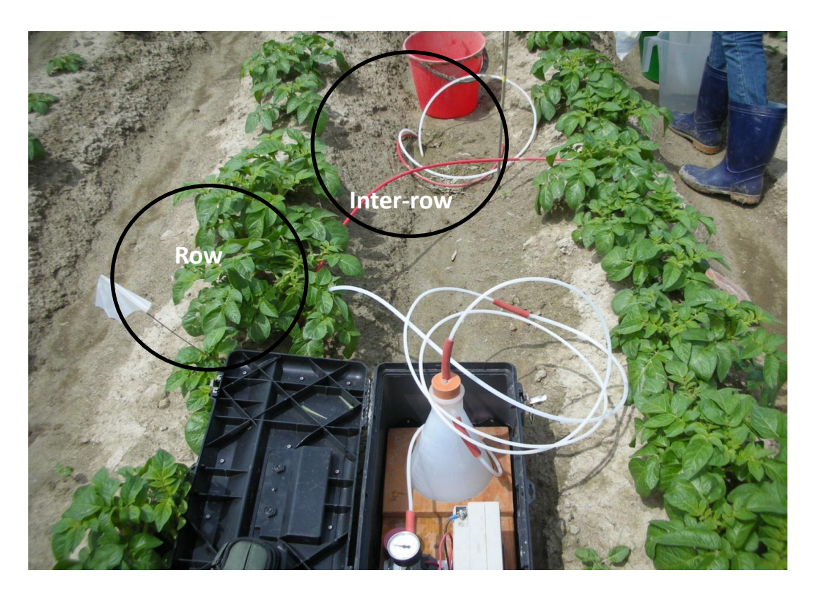
Figure 2 Extraction of drainage by connecting the tube to a pump. Each fluxmeter has two tubes to the surface, the white one to collect the water and the red for air entry and escape.