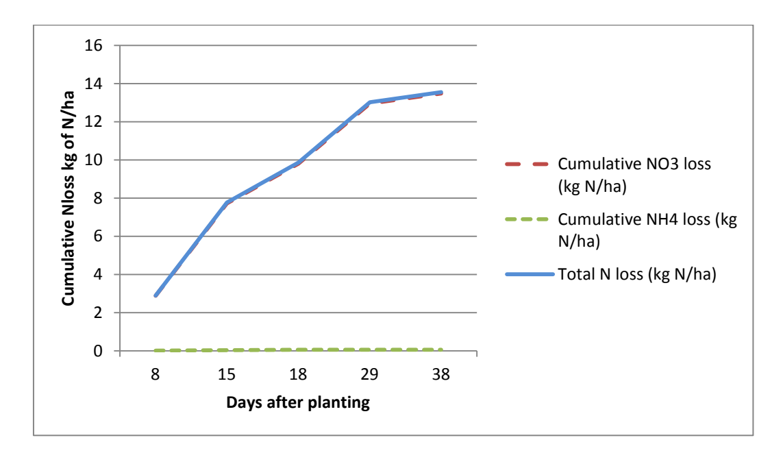
Figure 3. Cumulative nitrogen loss at Site-1, the Maori potatoes

The loss of nitrogen (N) was determined following analysis of the leachate for ammonium and nitrate. Nitrogen loss in the form of ammonium was very low. At Site 1, some 38 days after planting of the Maori potatoes, nitrate-nitrogen loss was 13.5 kg ha<sup>-1</sup> (Fig.3). This is equivalent to 87% of the nitrogen fertiliser that was applied at the rate of 15.4 kg N/ha at the time of planting. It is important to note that this fertiliser application rate is low compared to the commercial operations. Some of this lost nitrogen could be derived from the mineralization of organic matter. Nitrogen loss for the Site 2 is still being processed.