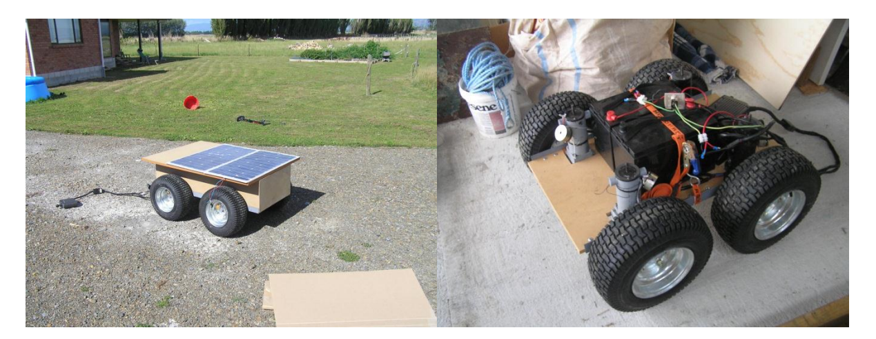
Figure 2: Mk I and II prototypes for design testing and development.

Selecting motor and gearbox combinations for robotic vehicles is both an art and a science, and calculated performance is often less than that achieved in real-world conditions (Piccirillo, 2009). Two prototype rover models were built to evaluate and refine aspects of design (Figure 2). Both used the same drive and control system – x4 second-hand 180 W 1:32 ratio 24 V Fracmo gearmotors (2-pole) salvaged from old wheelchairs and mounted to 406 mm turf wheels and tyres. Motor management is achieved through a 30 amp wheelchair controller, while power is provided by two 110 amp-hour 12 V deep-cycle gel batteries in series (24 V system). In being second-hand the motors were showing their age, and had variable individual levels of output performance.