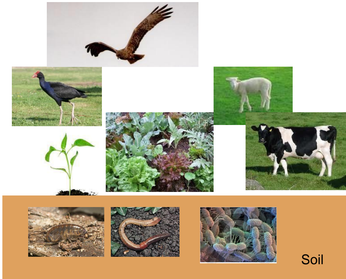
Figure 1 Receptors to be considered in the development of ecological soil guideline values.

In essence this project aims to develop Eco-SGVs for the most commonly encountered contaminants, and establish agreed methods for derivation such that values can subsequently be developed for other contaminants of concern as needed. Determination of background soil concentrations are included within this project as methodologies for deriving Eco-SGVs may include their use, or they may be used as criteria to ensuring environmental protection (e.g. cleanfill criteria).