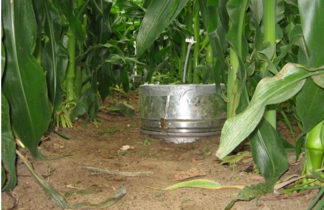
Figure 2. Gas sampling chamber in use in maize plot.

electron capture detector. From these results \text{N}_2\text{O} emission rates and emission factors (% of applied fertiliser N lost as \text{N}_2\text{O} , \text{EF}_1 ) were calculated.