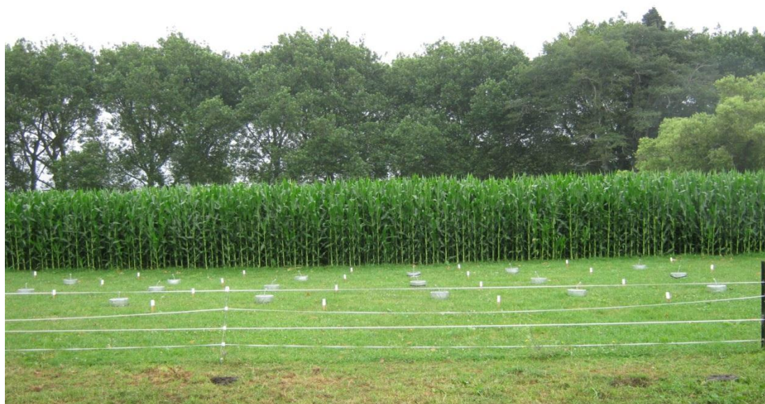
Figure 1: Trial site showing maize area and permanent pasture area in foreground with gas sampling chambers.

Pasture cuts were undertaken on the pasture trial on 19 November 2012, 12 December 2012, 27 December 2012, 11 March 2013, 14 May 2013, 7 June 2013 and 5 July 2013. Pasture was cut at about 45 mm to replicate a typical height after grazing. The extended period between cuts in December and March was a consequence of a summer drought for the 2012/13 period, which resulted in low pasture growth. As for the new grass in the maize growing area, urea was applied on 24 April at a rate of 25 kg N ha -1 .