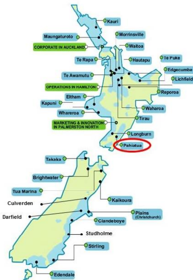
Figure 1 Fonterra manufacturing sites in New Zealand with Pahiatua factory site marked.

Under the One Plan Rule 14-2, such farms in a targeted WMS require a ‘consent to farm’ under which changes in management practices resulting in staged decreases in nitrogen leaching rates must be demonstrated. The irrigation farms comprising the Pahiatua factory LTS are run as dairy farms thus they required such consents for the farming activity (restricted discretionary activity) as well as a full discretionary activity resource consent for the ‘discharge of wastewater to land’ under Section 15(1)(b) of the Resource Management Act 1991 and Rule 14-30 ‘Discharges of water or contaminants to land or water not covered by other rules in the Plan or chapter’ of the One Plan.