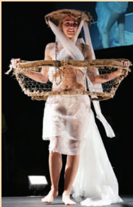
Ag Artwear at Mystery Creek Page 10