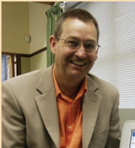
New director for distance education Page 7