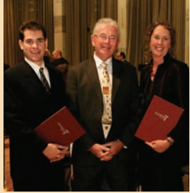
Teaching award recipients Page 3