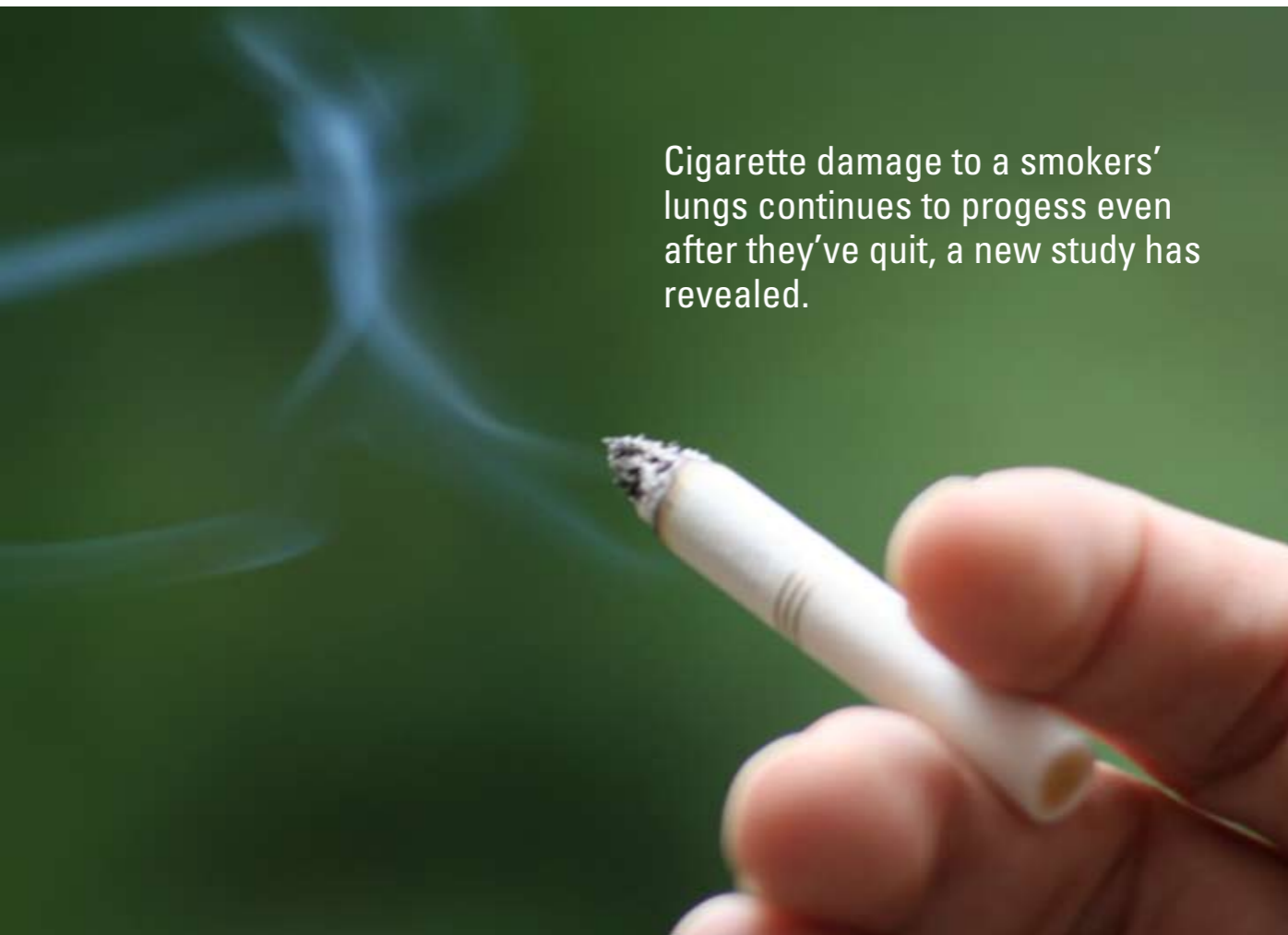
Cigarette damage to a smokers' lungs continues to progress even after they've quit, a new study has revealed.

This programme encourages innovative, theory-driven empirical research on social work practice,